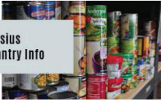
St. Aloysius Food Pantry Info

The St. Aloysius Food Pantry is offering Christmas food hampers and toys for families in need this year. If you or someone you know in our Parish Community could